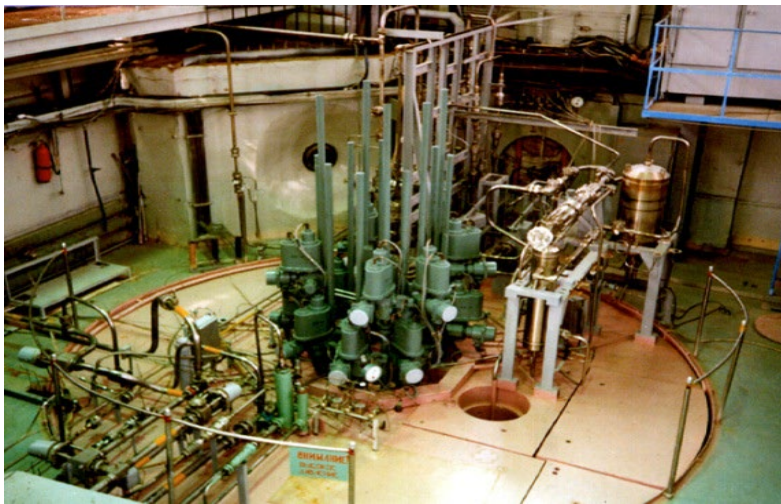
Bird's eye view of IGR core

A test vessel (a double containment vessel containing test fuel and sodium) is loaded into the experimental hole located at the center of the IGR core. We confirm the phenomenon where the test fuel, heated and melted by neutron irradiation from the core, flows out through the discharge duct.