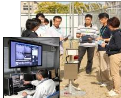
PP Exercise Field